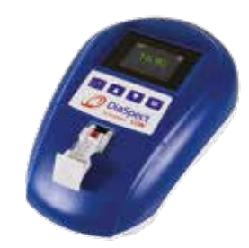
DiaSpect Hemoglobin T Low