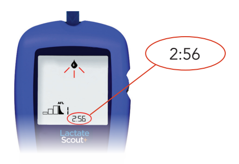
Display of the expired time following the last load measurement via the afterload timer

Using the Countdown function "COUNT DOWN" preceded by the step duration "DUR", it is possible to set times of up to 10 minutes and to set a signal as they elapse (page 20).